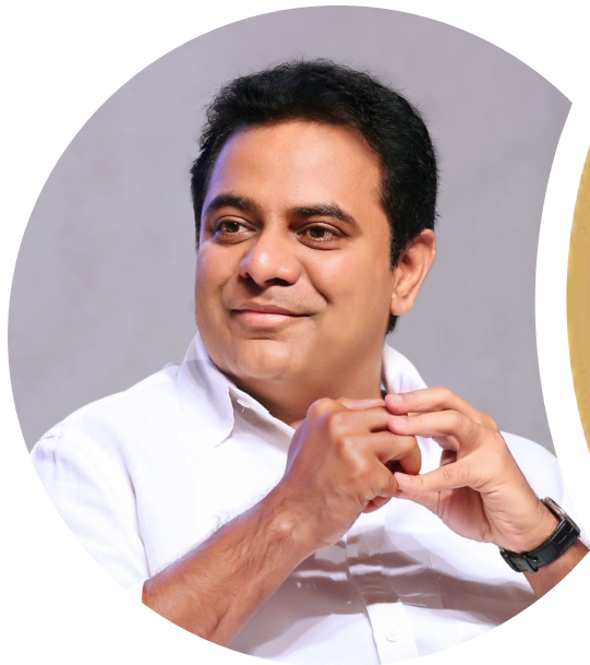
Shri K. T. Rama Rao

Minister for IT E&C, MA&UD and Industries & Commerce