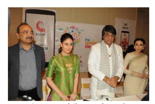
ICFFI - Mobile app launch