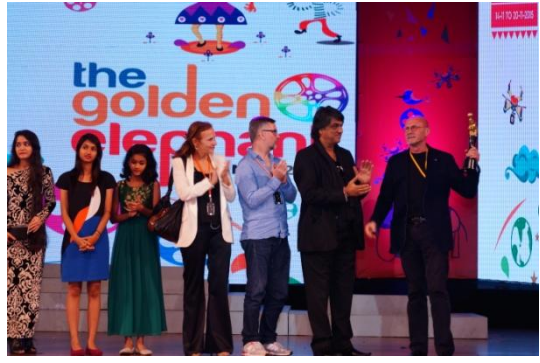
ICFFI - Awards

2. The closing function was followed by the screening of the award-winning Russian Film 'Celestial Camel' which won the Golden Elephant Trophy for the Best Feature Film (Competition Live Action), and also the Best Director for Live Action Feature film.